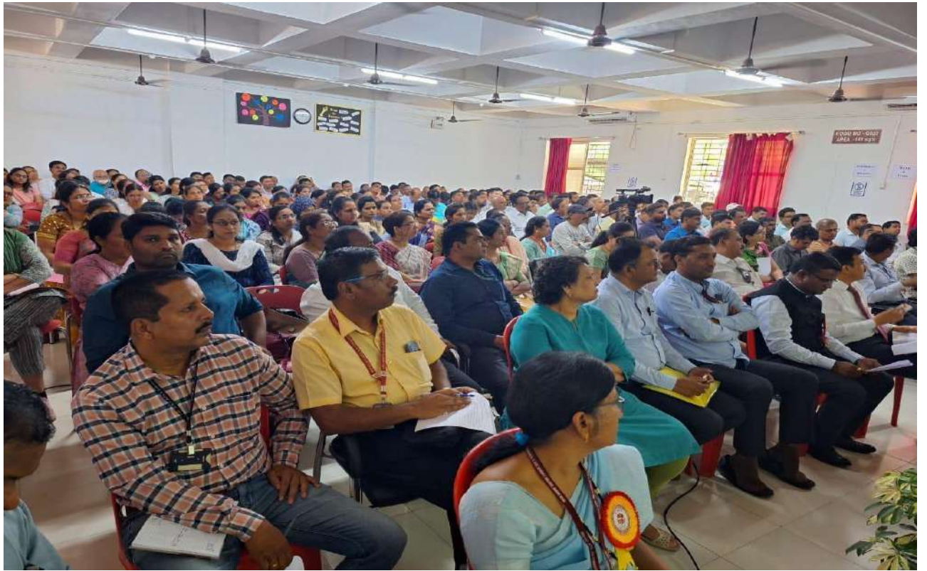
Overwhelming Response of the Participant for the University Level Workshop on “Implementation of National Education Policy 2020 in the Faculty of Humanities” date 14/05/2024