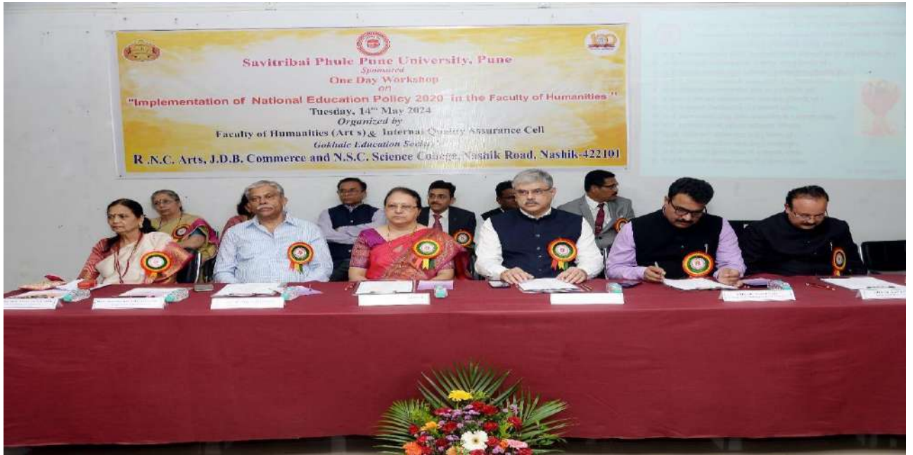
Hon. Guests at Inaugural ceremony of University Level Workshop for Nashik District On 'Implementation of National Education Policy 2020 In the Faculty of Humanities' Date: 14 th May 2024