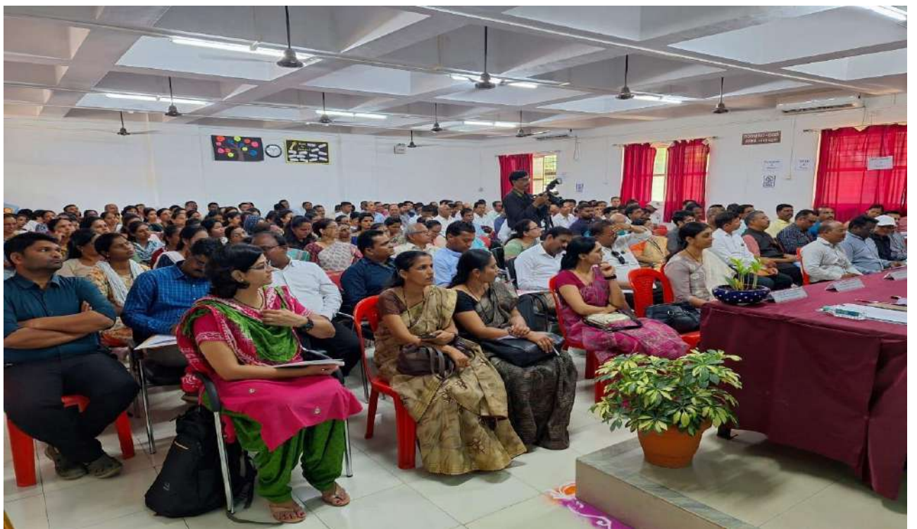
Overwhelming Response of the Participant for the University Level Workshop on “Implementation of National Education Policy 2020 in the Faculty of Humanities” date 14/05/2024