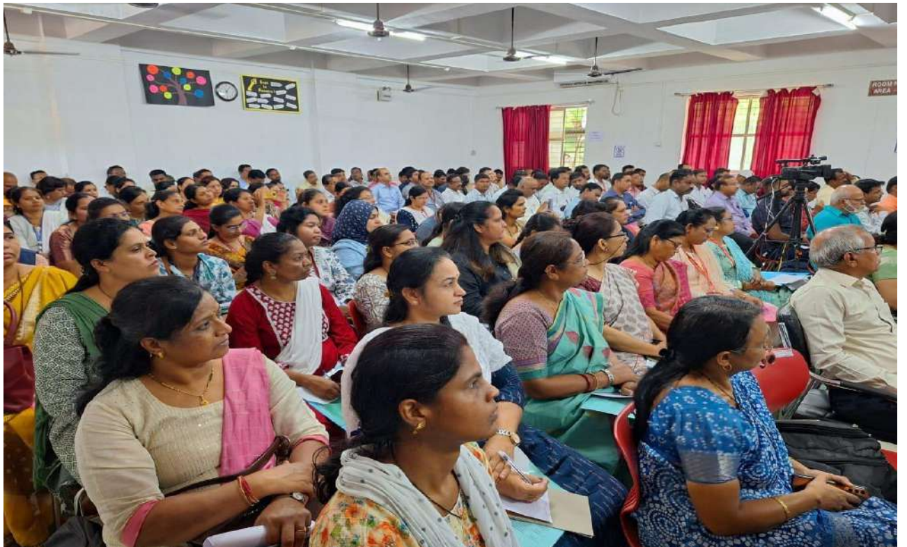
Overwhelming Response of the Participant for the University Level Workshop on “Implementation of National Education Policy 2020 in the Faculty of Humanities” date 14/05/2024