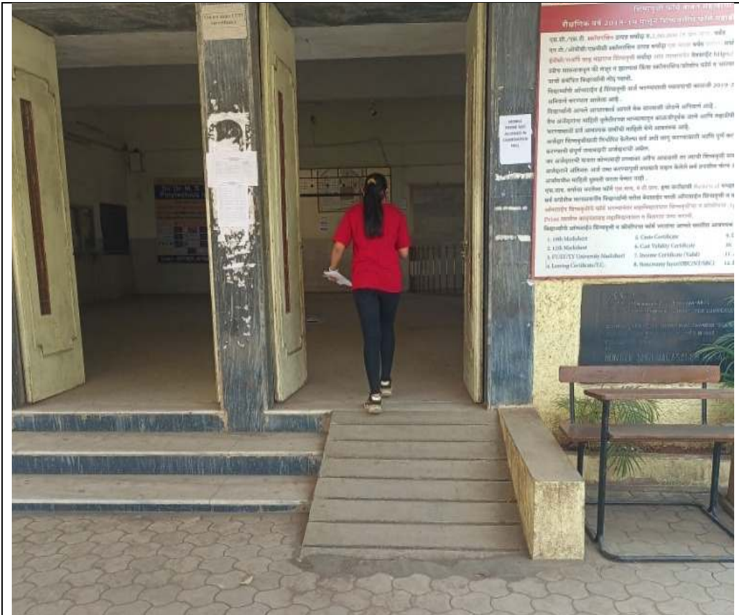
Ramps for disability students