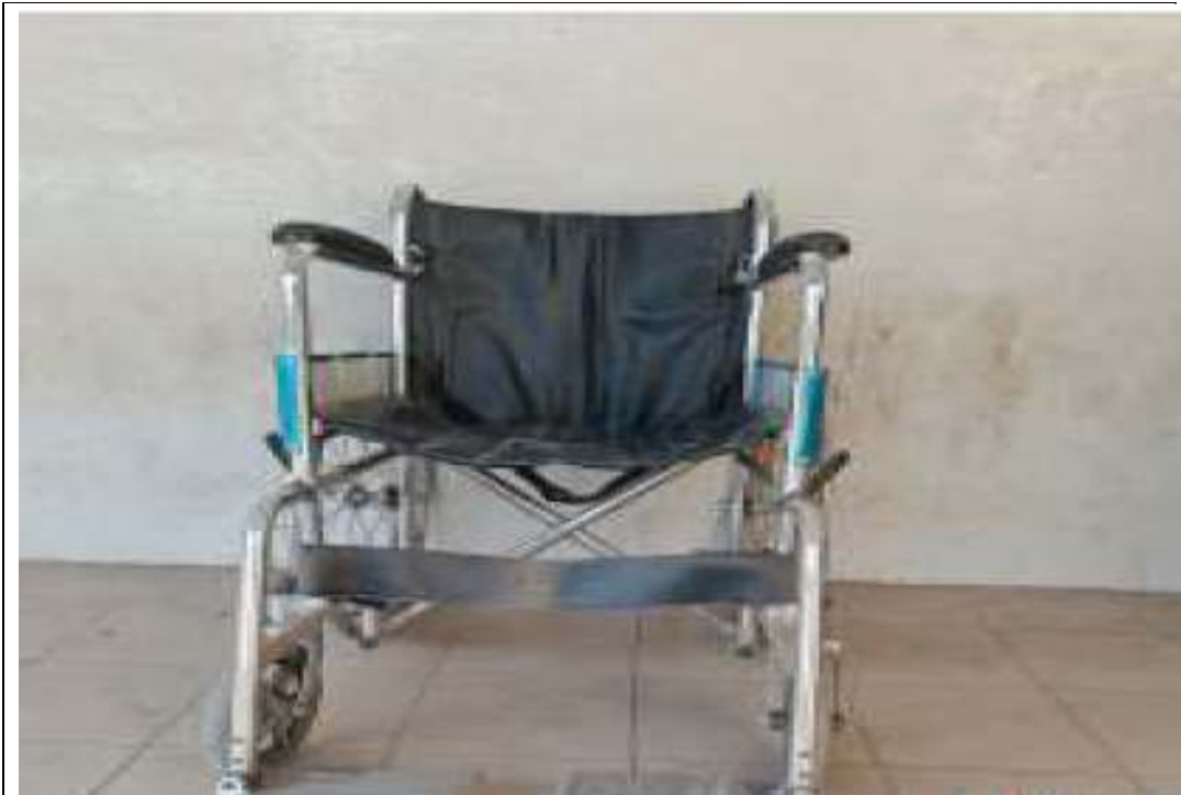
Wheel Chair for Disability students