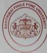
President Board of Sports & Physical Education