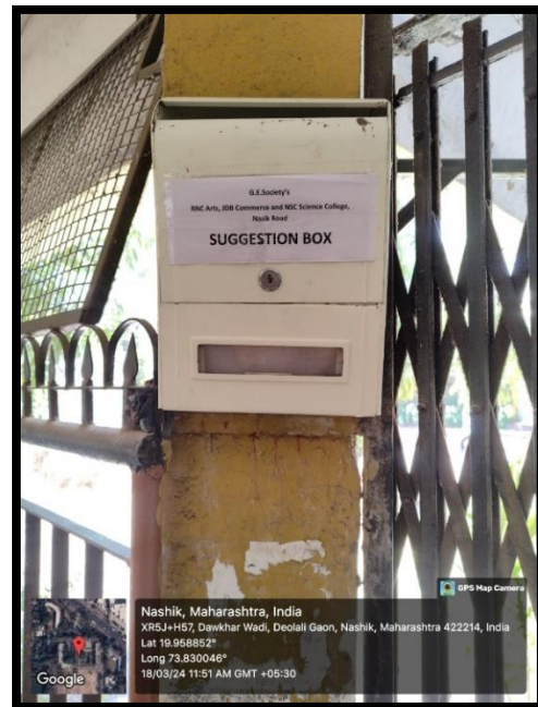
Suggestion box near Vice Principal Cabin