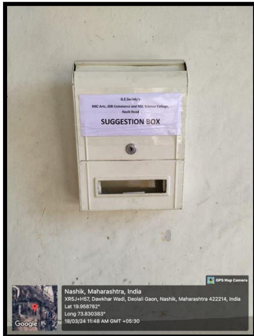
Suggestion Box near Hall. No 17

The Institute collects suggestions, Complaints or any grievances of the student through suggestion box. It creates a safe environment for student to share their concerns without revealing the identity.