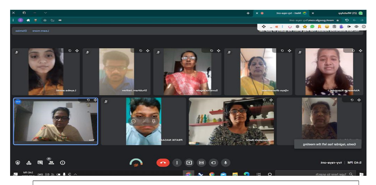
Attendance of 1<sup>st</sup> online meeting of Anti-sexual harassment Committee- 18/12/2021